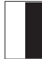
1/2 tall 16 x 5