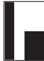
1/4 8 x 5, 16 x 2.5