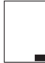
Bus. Card 2 x 3.5