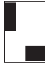
1/8 4 x 5, 8 x 2.5