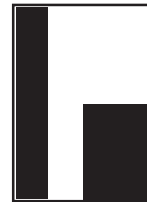
1/4 8 x 5, 16 x 2.5