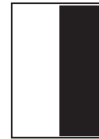
1/2 tall 16 x 5