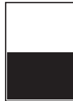
1/2 wide 8 x 10