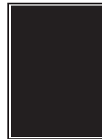
Full 16 x 10