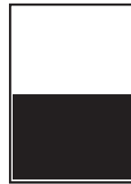
1/2 wide 8 x 10