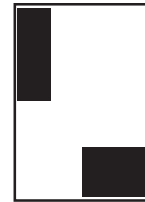
1/8 4 x 5, 8 x 2.5