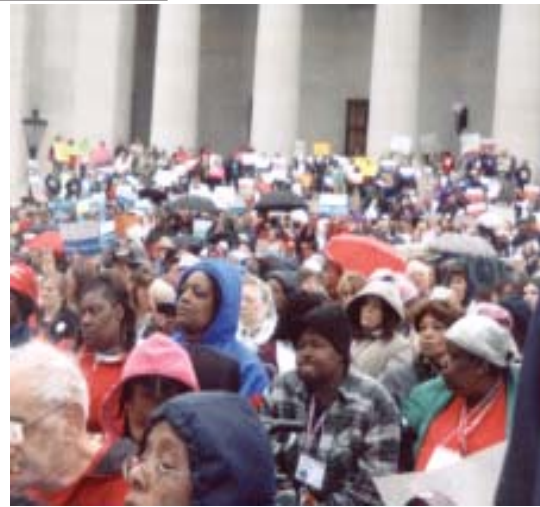
Protesting budget cuts at the state capital